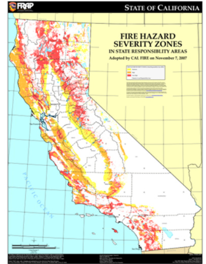
Map Source: CALFIRE / FRAP